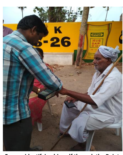
Farmer identifying himself through the Pointof-Sale machine.

The pilot phase of this DBT was rolled out in Rabi 2016/17. Rabi typically witnesses relatively less fertilizer demand, and this period of low demand saw some successes in the system. For example, retailers charged printed maximum retail prices (MRPs) for fertilizer as compared with the higher prices they would have charged earlier, and there were no delays in fertilizer availability (although this was attributed to the mFMS). Anecdotal evidence suggests that before the introduction of PoS, retailers could make sales without printing sales receipts, and sell fertilizer in loose quantities (smaller than the standard 50-kilogram bags of urea). In that way, they might mark up prices above the MRP. Farmers told us of several instances of dealers exercising monopoly power, citing supply shortages, and marking up prices.