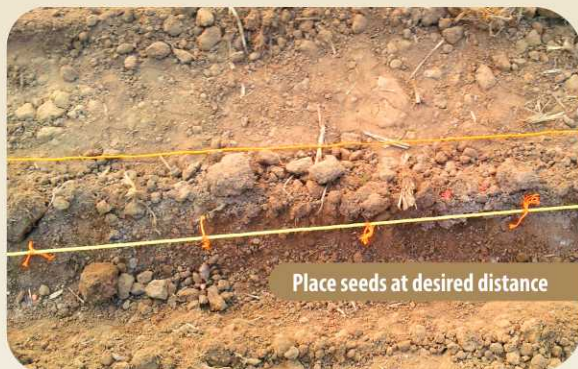
Place seeds at desired distance