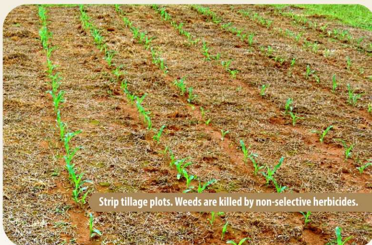
Strip tillage plots. Weeds are killed by non-selective herbicides.

Don't apply paraquat if perennial weeds are present. In such situations, apply glyphosate.