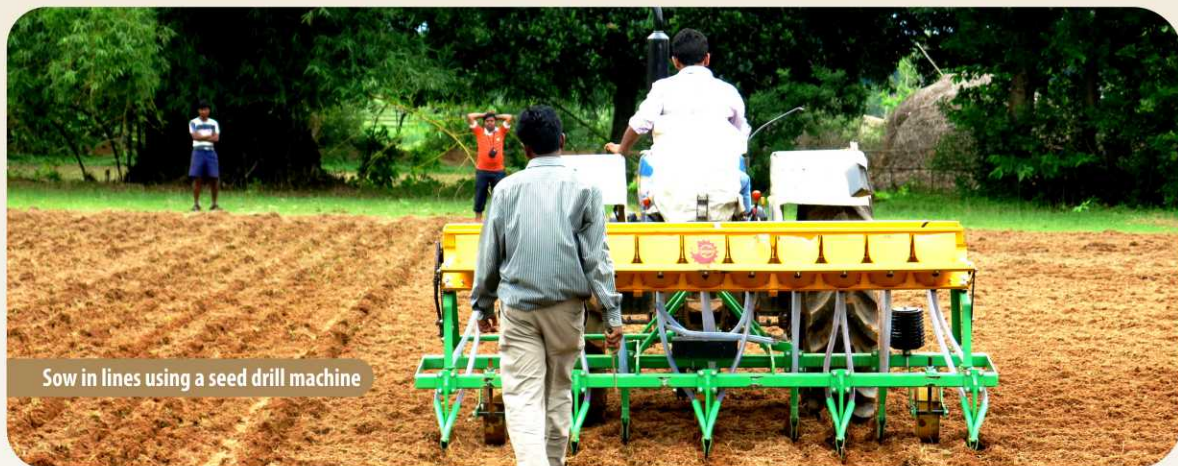
Sow in lines using a seed drill machine