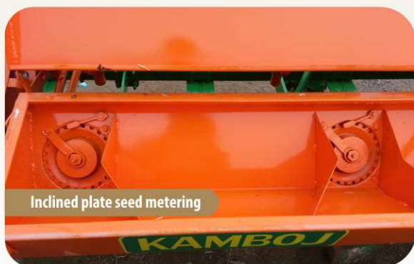
Inclined plate seed metering