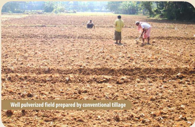
Well pulverized field prepared by conventional tillage