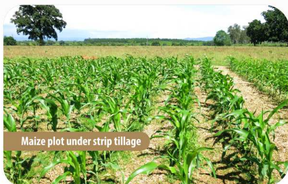
Maize plot under strip tillage