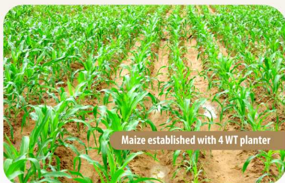
Maize established with 4 WT planter