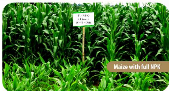
Response of N, P, and K fertilizer in plateau of Odisha.