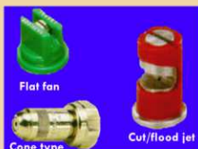
Type of nozzle tips: Flat fan, cut/flood jet and cone type.

Don't use cone type nozzles for herbicide spraying. Either use the flat fan with a multiple nozzle boom or the cut/flood type with a single nozzle boom.