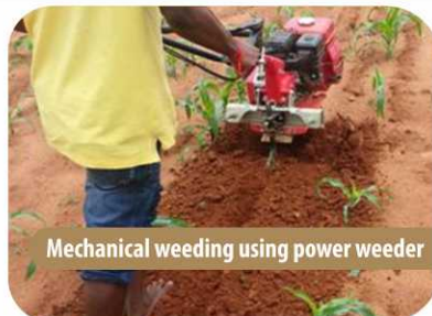
Mechanical weeding using power weeder