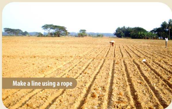
Make a line using a rope