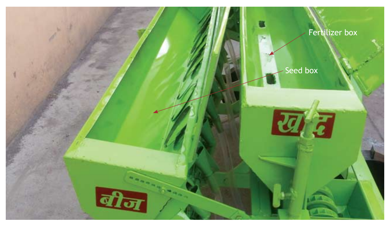
Figure 4. Seed and fertilizer box

and 24 cm deep. Box dimensions can vary depending upon the effective width of the machine and will increase with the increase in the number of the furrow openers. For example in case of 9-tine planter, the length of seed and fertilizer boxes will be around 160 cm.