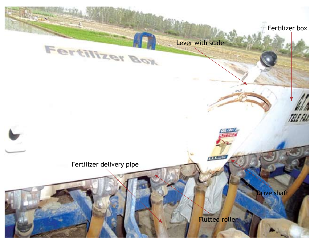
Figure 11. Fertilizer metering system