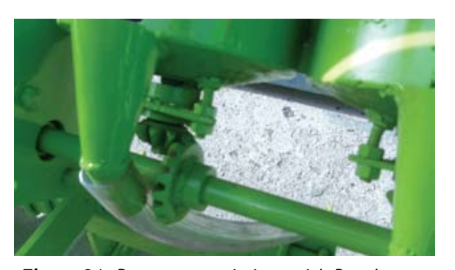
Figure 21. Power transmissions with Bevel gears