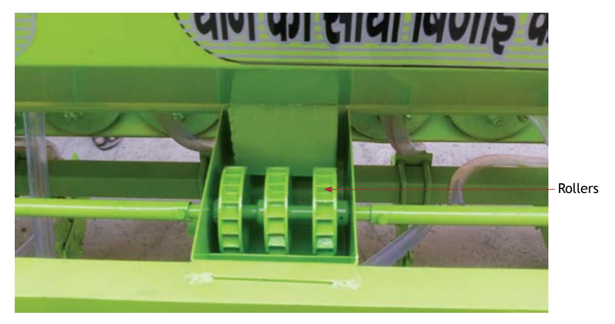
Figure 17. Cup/cell type roller

and fertilizer metering gears. The diameter of the drive wheel in the multi-crop planters available in India is 25 or 30 cm. Chains are attached to the drive wheel and to the driving shaft. There are lugs on the circumference of drive wheel. Lugs are provided to avoid or