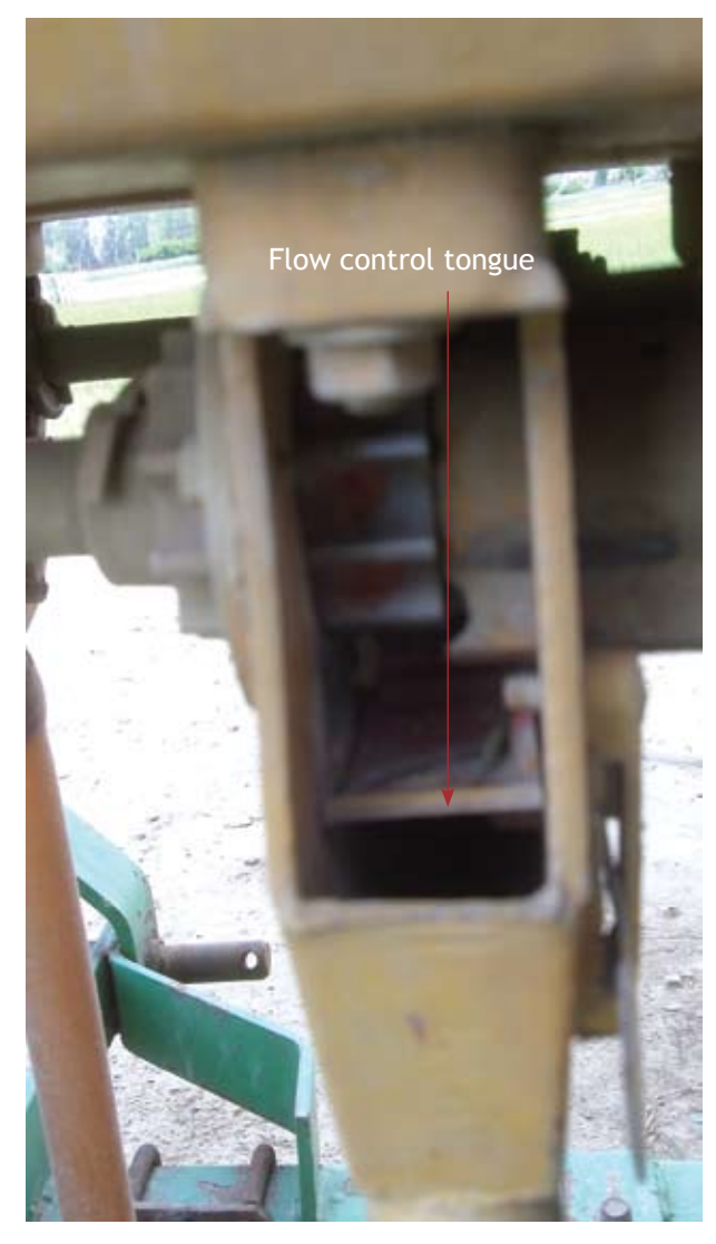
Figure 13. Flow control tongue

The second system (Figure 15) is the rotating cell type fertilizer metering type. This system has the following components.