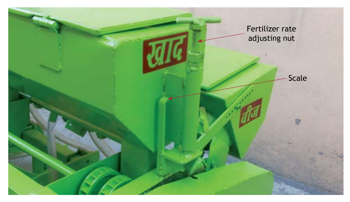
Figure 16. Fertilizer rate adjustment