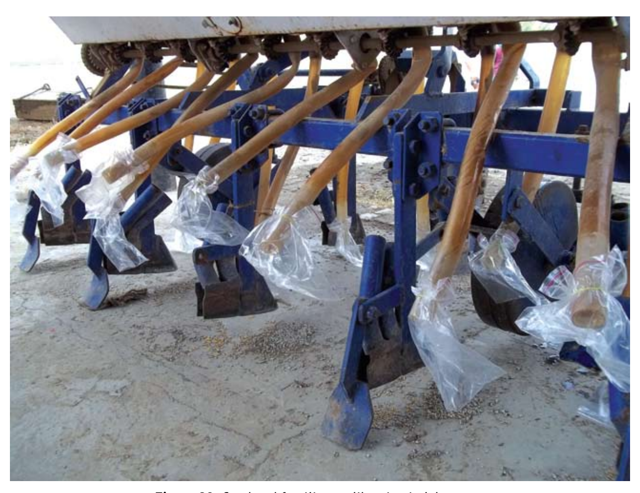
Figure 23. Seed and fertilizer calibration in laboratory