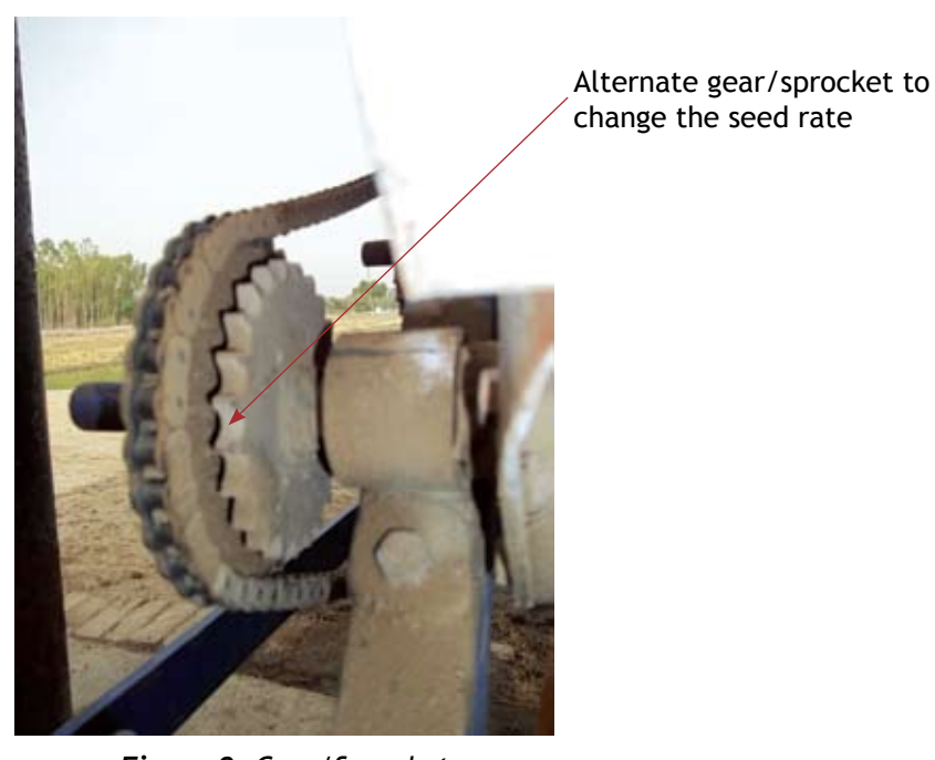
Figure 9. Gear/Sprocket