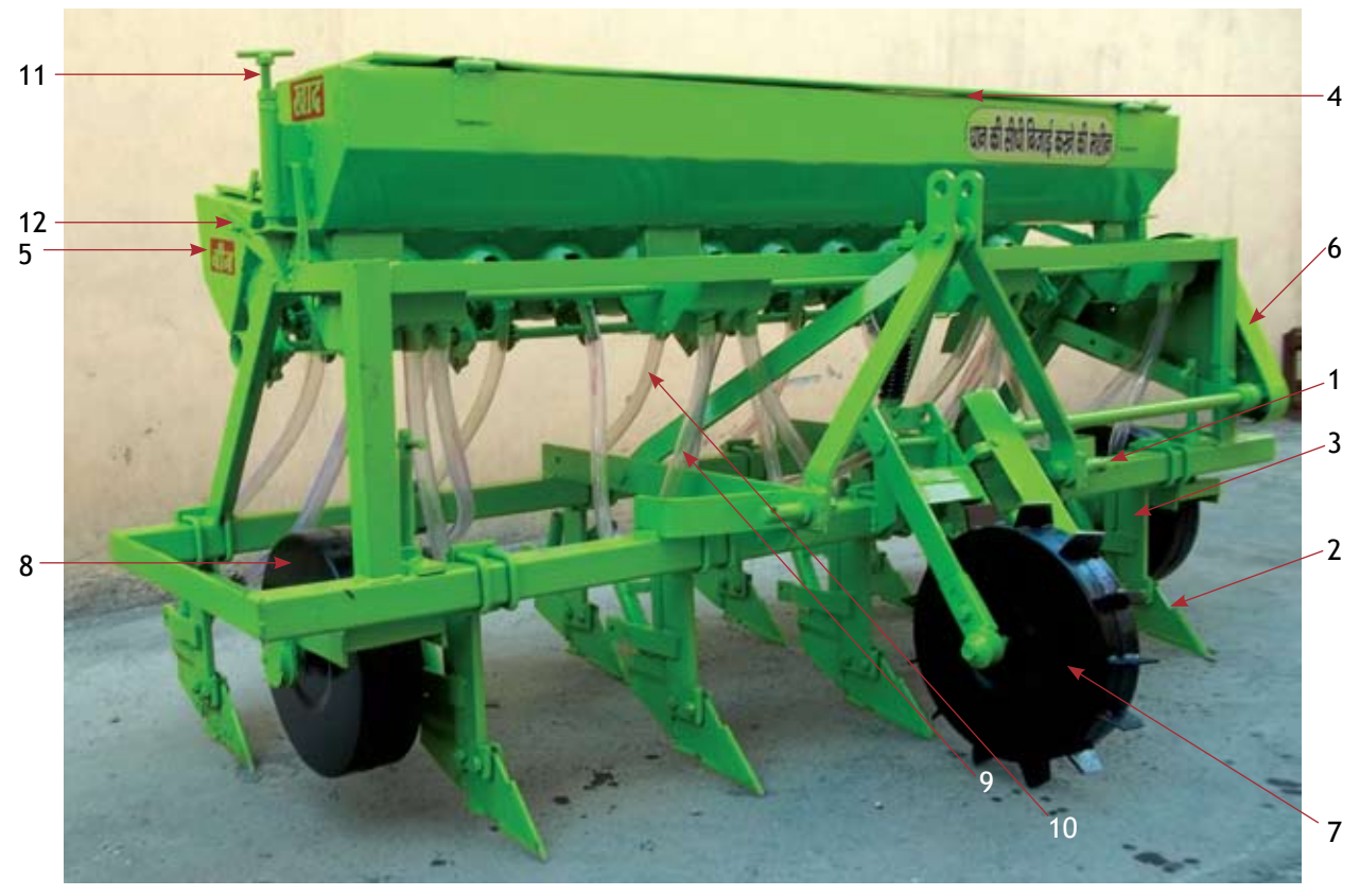
1. Frame, 2. Furrow openers, 3. Tynes, 4. Fertilizer box, 5. Seed box, 6. Chain and gear drives, 7. Drive wheel, 8. Depth control wheel, 9. Fertilizer delivery pipe, 10. Seed pipe, 11. Fertilizer rate adjusting nut, 12. Seed rate adjusting strip