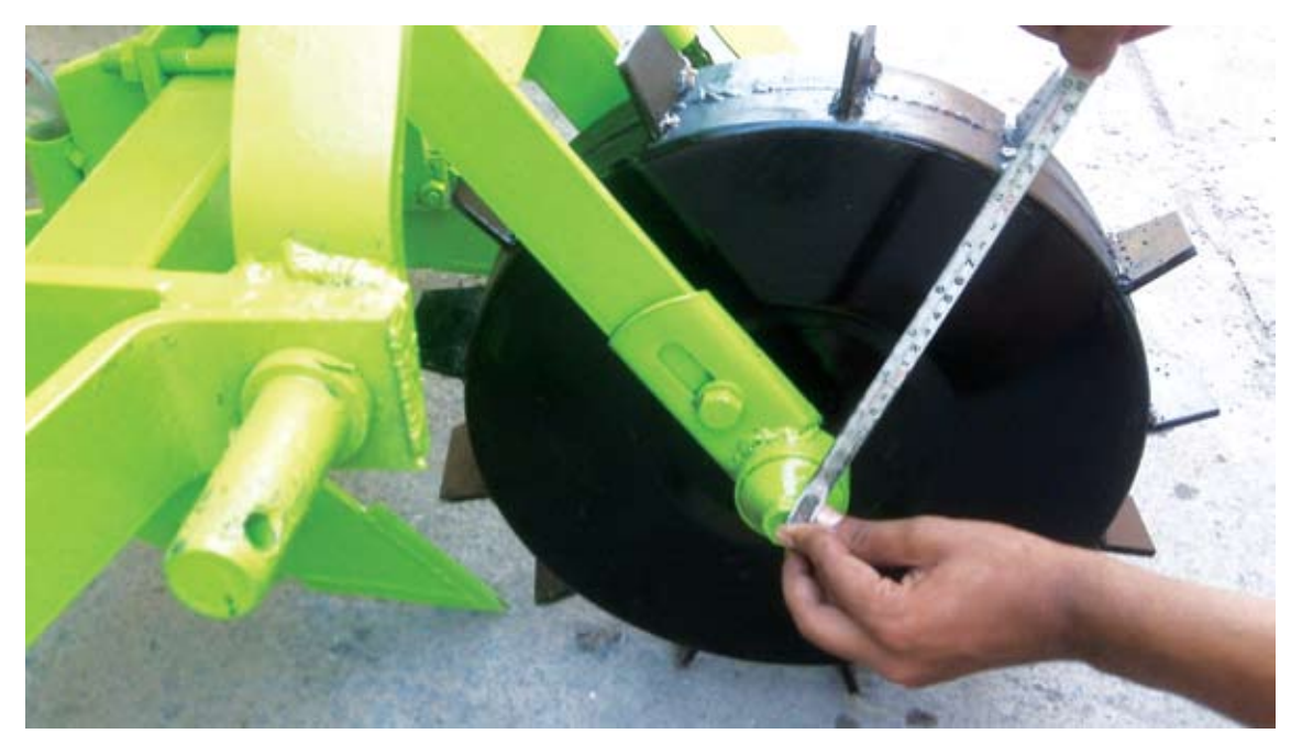
Figure 24. Diameter of drive Wheel