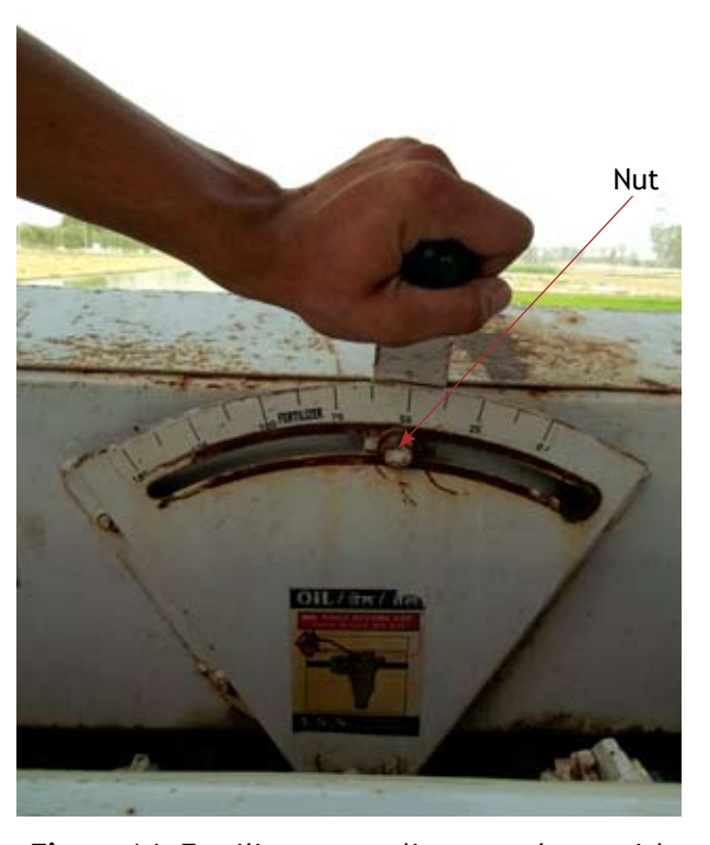
Figure 14. Fertilizer rate adjustment lever with scale and nut

In this fertilizer metering device, cells are