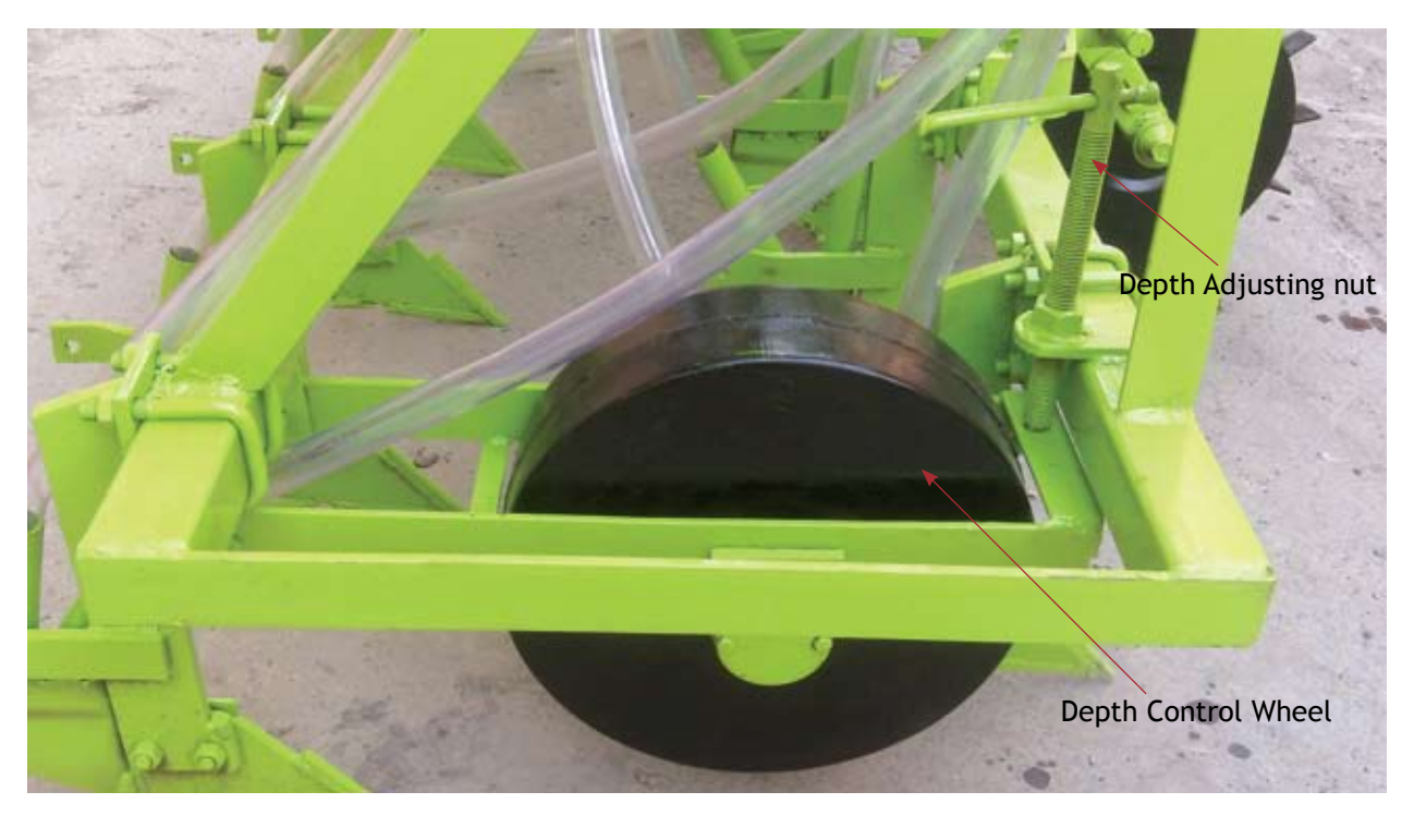
Figure 19. Depth control wheel and its adjustment

depth. Two depth control wheels are attached to the frame. The diameter of wheels is about 25-30 cm. It is made of mild steel and of rubber in some types of planters. The function of these wheels is to control depth of the seed and fertilizer into the soil through regulating the depth of furrow openers. The depth of seed and fertilizer placement can be increased or decreased with the help of depth adjusting screw pointed out in figure 19. It is a nut and bolt mechanism attached to the frame. There are fix number of threads per inch in the bolt. The lower nut is adjusted for the depth control. For example, if we have to increase the depth of the machine by one inch and there are 9 threads per inch then we have to move the lower nut by nine threads in the upper direction and tighten the upper nut. The adjustment of depth control should be done in the field itself to capture the real field situation.