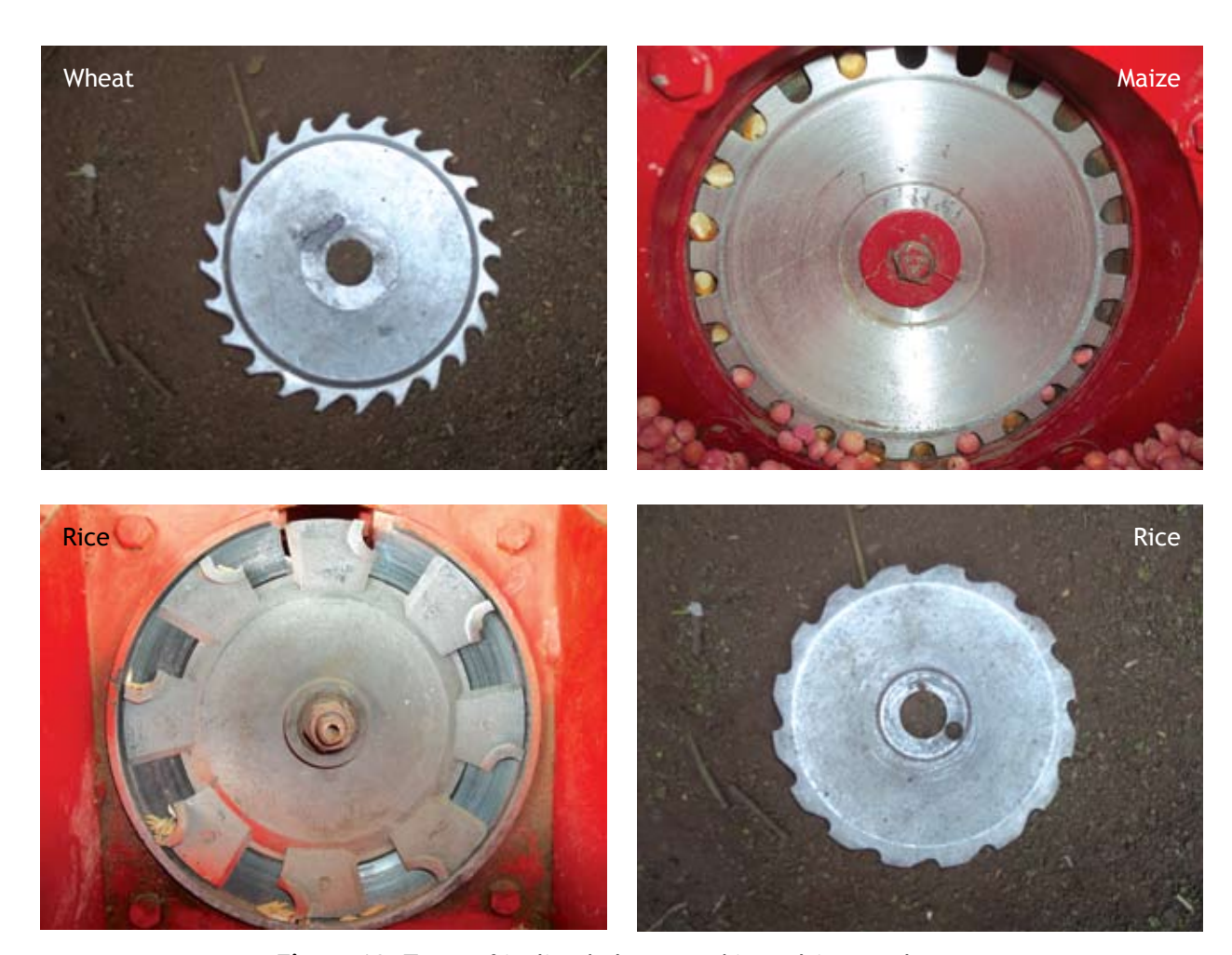
Figure 10. Types of inclined plates used in multi-crop planter