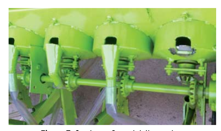
Figure 7. Seed cups & seed delivery pipe