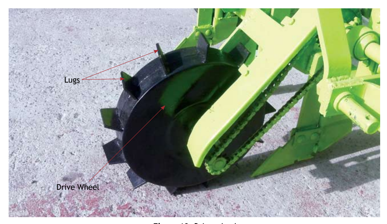
Figure 18. Drive wheel

The depth control wheel (Figure 19) is essential for placement of seeds and fertilizer at right