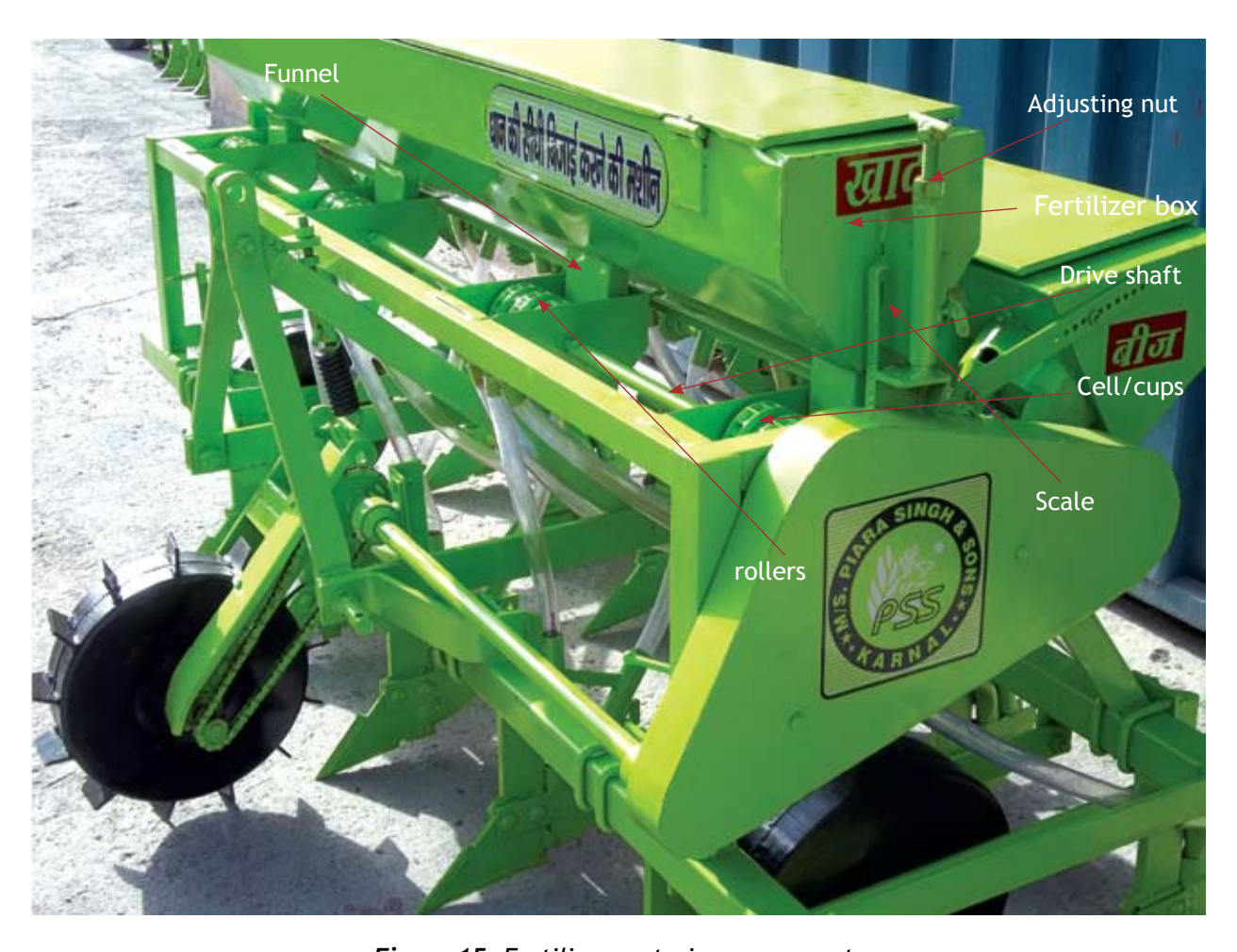
Figure 15. Fertilizer metering components