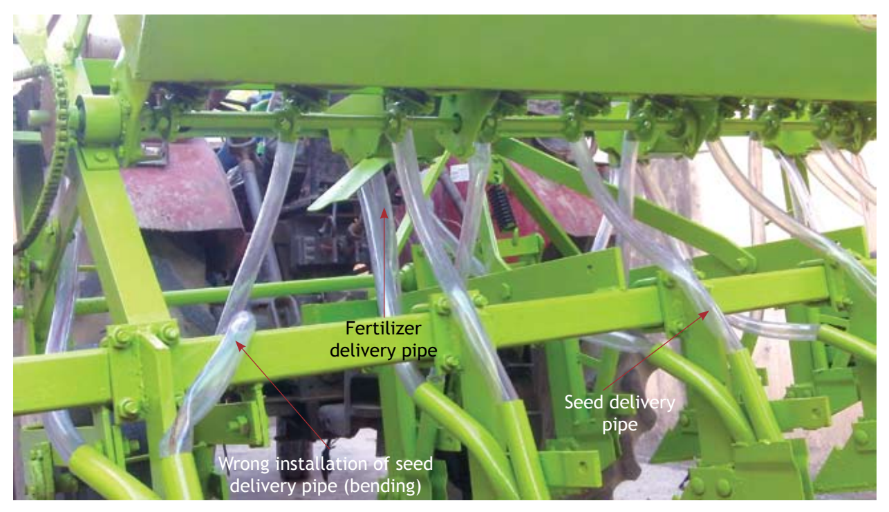
Figure 22. Seed and fertilizer delivery pipes

else multiply the number of tynes with distance between two tynes. Put seed in seed box and fertilizer in fertilizer box then rotate drive wheel manually to ten full rotations and collect seed delivered from each seed/fertilizer delivery tube separately in polythene bags (Figure 23). Weigh the seeds and fertilizer in each bag and also determine the total seed weight (Sw) and fertilizer weight (Fw). If the difference in seed/ fertilizer weight between individual delivery tubes is more than 10%, contact a mechanic/ expert to adjust or repair the machine. Calculate seed and fertilizer application rate per hectare using the following formula: