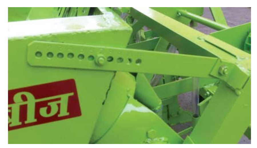
Figure 8. Seed metering strip with seed rate scale on it

seed rate may also be adjusted by putting the chain on different gears (Figure 9). Using the gear with lesser teeth will lower down the seed rate and vice-versa.