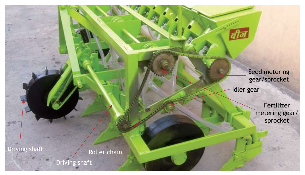
Figure 20. Power transmission unit and chain Mechanism