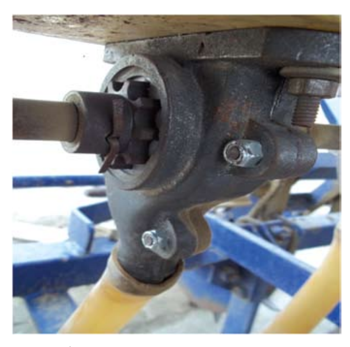
Figure 12. Flutted roller with shaft