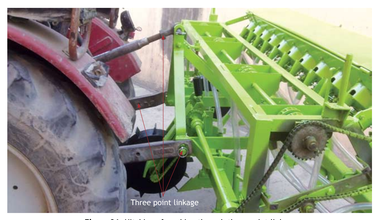
Figure 26. Hitching of machine through three-point linkage

The planter has three standard hitch points (Figure 26); two lower and one top links. The