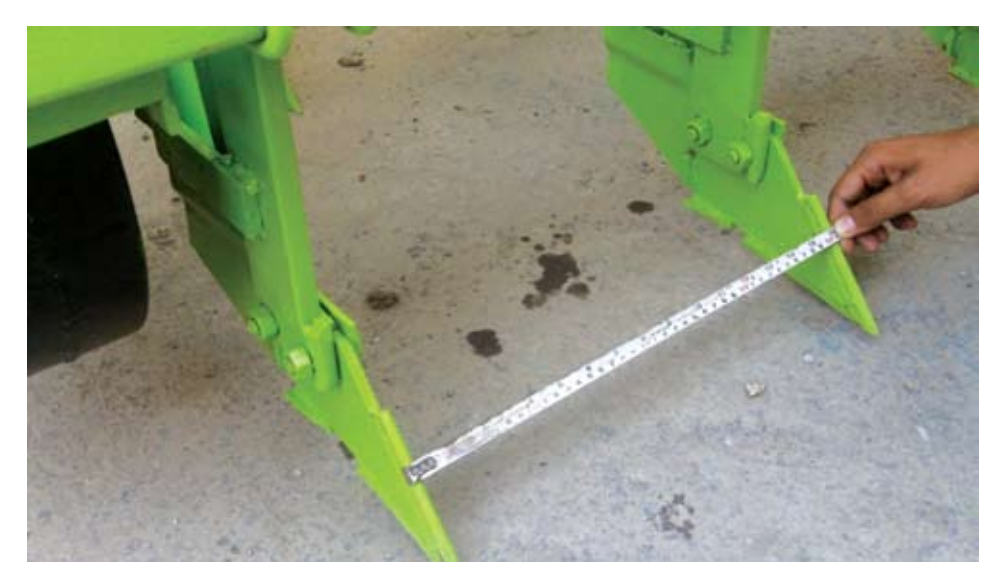
Figure 25. Distance between two alternate furrows

Distance = 20 m Weight of seed or fertilizer in pipes = y Seed rate or fertilizer rate per acre = \frac{4000 \times \text{Width of drill}}{\text{Weight of seed or fertilizer} \times \text{distance}}