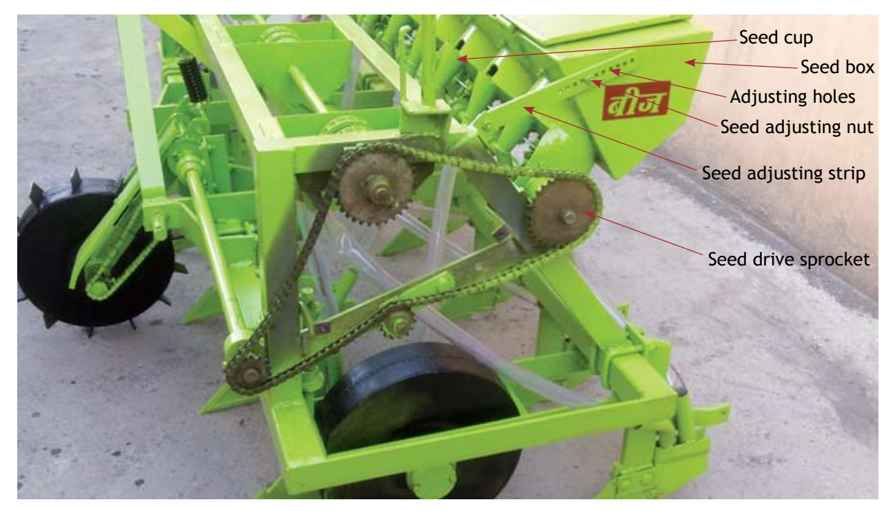
Figure 5. Seed metering mechanism and its components