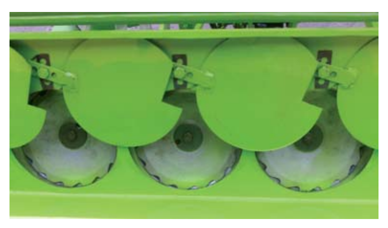
Figure 6. Inclined rotary plates (inside the seed box)